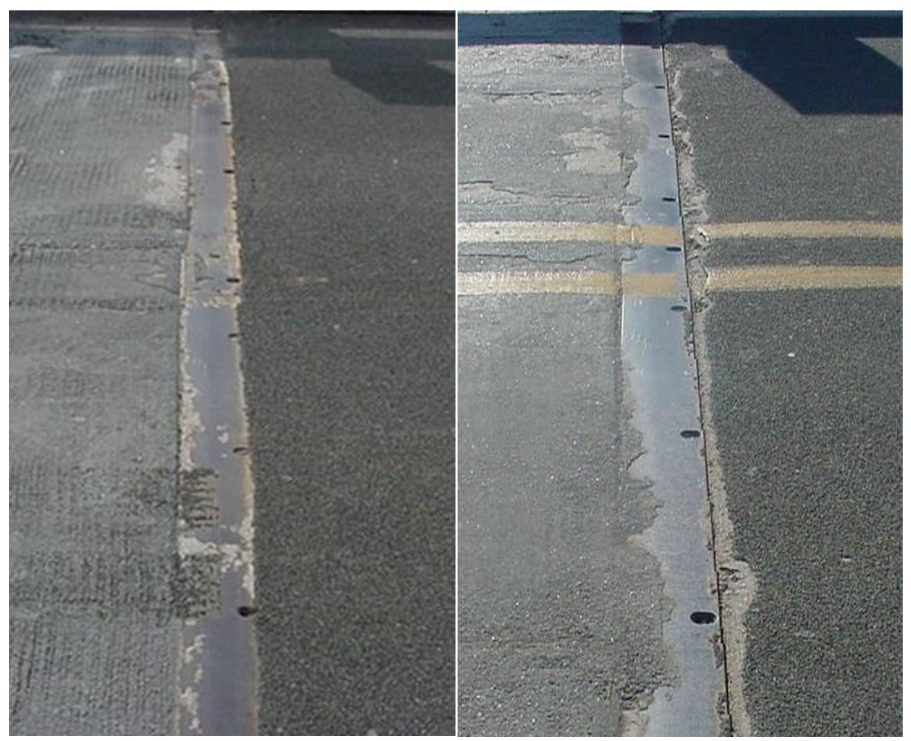
Figure 1 - Polycon (Left) and Sikadur (Right) May 2000 October 2005

No records were available to ascertain the exact locations of the original test holes. With 95% of the traveled bridge deck having been patched, there was little hope of actually finding a section of original bridge deck to test without removing the overlay or drilling in the gutter sections. In order to be relevant, corrosion protection comparisons between each overlay requires comparative sampling be taken in close proximity to the previous test holes. Shown below in Figure 1 for easy comparison is a photo taken after the initial installation and one taken recently.